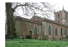
In aid of St Mary's Church